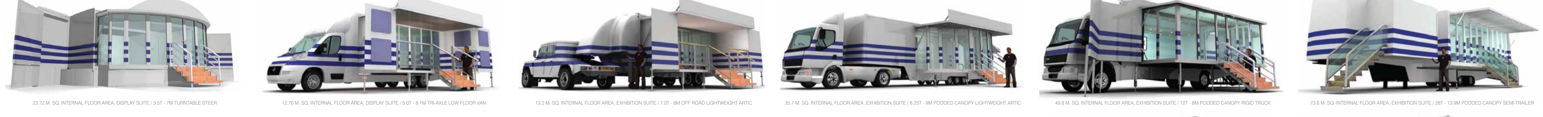
23.72 M. SQ. INTERNAL FLOOR AREA, DISPLAY SUITE / 3.5T - 7M TURNABLE STEER | 12.76 M. SQ. INTERNAL FLOOR AREA, DISPLAY SUITE / 5.0T - 8.1M TRI-AXLE LOW FLOOR VAN | 13.2 M. SQ. INTERNAL FLOOR AREA, EXHIBITION SUITE / 7.0T - 8M OFF ROAD LIGHTWEIGHT ARTIC | 37.7 M. SQ. INTERNAL FLOOR AREA, EXHIBITION SUITE / 8.25T - 9M PODED CANOPY LIGHTWEIGHT ARTIC | 49.8 M. SQ. INTERNAL FLOOR AREA, EXHIBITION SUITE / 12T - 8M PODED CANOPY RIGID TRUCK | 73.8 M. SQ. INTERNAL FLOOR AREA, EXHIBITION SUITE / 28T - 13.9M PODED CANOPY SEMI-TRAILER