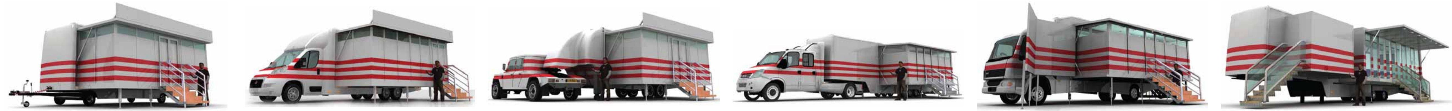
24.46 M. SQ. INTERNAL FLOOR AREA, PORTABLE CLASSROOM / 3.5T - 7M TURNABLE STEER | 22.36 M. SQ. INTERNAL FLOOR AREA, PORTABLE CLASSROOM / 5.0T - 8.1M TRI-AXLE LOW FLOOR VAN | 23.2 M. SQ. INTERNAL FLOOR AREA, PORTABLE CLASSROOM / 7.0T - 8M OFF ROAD LIGHTWEIGHT ARTIC & 4X4 TRACTOR | 38.8 M. SQ. INTERNAL FLOOR AREA, PORTABLE CLASSROOM / 8.25T - 9M LIGHTWEIGHT SEMI-TRAILER & TRACTOR | 49.8 M. SQ. INTERNAL FLOOR AREA, PORTABLE CLASSROOM / 12T - 8M BODIED PODED GULL WING RIGID | 48.8 M. SQ. INTERNAL FLOOR AREA, PORTABLE CLASSROOM / 28T - 13.9M BODIED QUAD POD SEMI-TRAILER