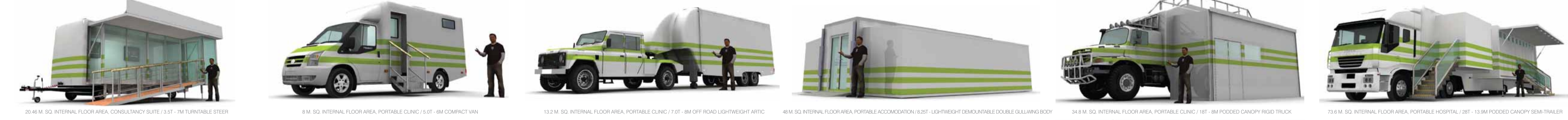
20.46 M. SQ. INTERNAL FLOOR AREA, CONSULTANCY SUITE / 3.5T - 7M TURNABLE STEER | 8 M. SQ. INTERNAL FLOOR AREA, PORTABLE CLINIC / 5.0T - 8M COMPACT VAN | 13.2 M. SQ. INTERNAL FLOOR AREA, PORTABLE CLINIC / 7.0T - 8M OFF ROAD LIGHTWEIGHT ARTIC | 48 M. SQ. INTERNAL FLOOR AREA, PORTABLE ACCOMMODATION / 8.25T - LIGHTWEIGHT DEMOUNTABLE DOUBLE GULLWING BODY | 34.8 M. SQ. INTERNAL FLOOR AREA, PORTABLE CLINIC / 12T - 8M PODED CANOPY RIGID TRUCK | 73.8 M. SQ. INTERNAL FLOOR AREA, PORTABLE HOSPITAL / 28T - 13.9M PODED CANOPY SEMI-TRAILER