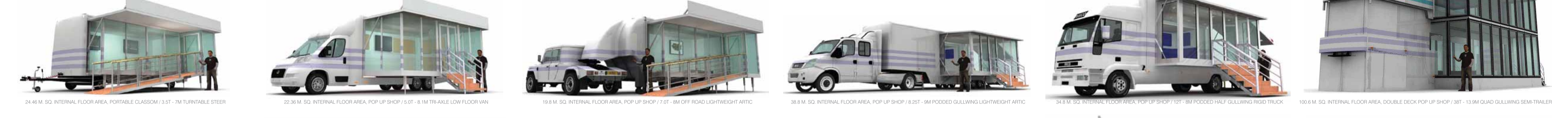
24.46 M. SQ. INTERNAL FLOOR AREA, PORTABLE CLASSROOM / 3.5T - 7M TURNABLE STEER | 22.36 M. SQ. INTERNAL FLOOR AREA, POP UP SHOP / 5.0T - 8.1M TRI-AXLE LOW FLOOR VAN | 19.8 M. SQ. INTERNAL FLOOR AREA, POP UP SHOP / 7.0T - 8M OFF ROAD LIGHTWEIGHT ARTIC | 38.8 M. SQ. INTERNAL FLOOR AREA, POP UP SHOP / 8.25T - 9M PODED GULLWING LIGHTWEIGHT ARTIC | 34.8 M. SQ. INTERNAL FLOOR AREA, POP UP SHOP / 12T - 8M PODED HALF GULLWING RIGID TRUCK | 100.6 M. SQ. INTERNAL FLOOR AREA, DOUBLE DECK POP UP SHOP / 28T - 13.9M QUAD GULLWING SEMI-TRAILER