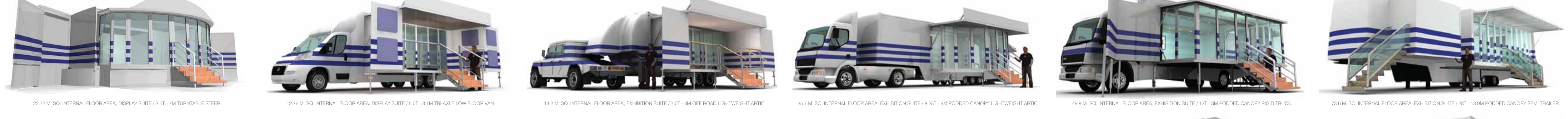
23.72 M. SQ. INTERNAL FLOOR AREA, DISPLAY SUITE / 3.5T - 7M TURNABLE STEER | 12.76 M. SQ. INTERNAL FLOOR AREA, DISPLAY SUITE / 5.0T - 8.1M TRI-AXLE LOW FLOOR VAN | 13.2 M. SQ. INTERNAL FLOOR AREA, EXHIBITION SUITE / 7.0T - 8M OFF ROAD LIGHTWEIGHT ARTIC | 37.7 M. SQ. INTERNAL FLOOR AREA, EXHIBITION SUITE / 8.25T - 9M PODED CANOPY LIGHTWEIGHT ARTIC | 49.8 M. SQ. INTERNAL FLOOR AREA, EXHIBITION SUITE / 12T - 8M PODED CANOPY RIGID TRUCK | 73.6 M. SQ. INTERNAL FLOOR AREA, EXHIBITION SUITE / 28T - 13.9M PODED CANOPY SEMI-TRAILER