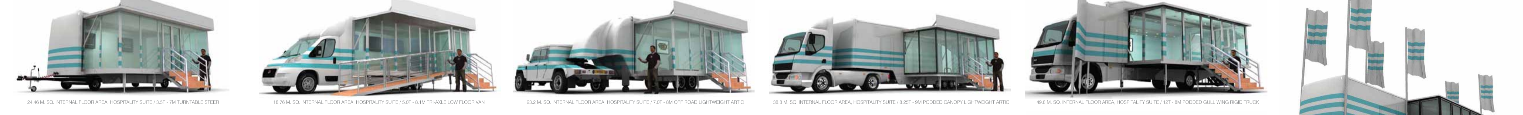
24.46 M. SQ. INTERNAL FLOOR AREA, HOSPITALITY SUITE / 3.5T - 7M TURNABLE STEER | 18.76 M. SQ. INTERNAL FLOOR AREA, HOSPITALITY SUITE / 5.0T - 8.1M TRI-AXLE LOW FLOOR VAN | 23.2 M. SQ. INTERNAL FLOOR AREA, HOSPITALITY SUITE / 7.0T - 8M OFF ROAD LIGHTWEIGHT ARTIC | 38.8 M. SQ. INTERNAL FLOOR AREA, HOSPITALITY SUITE / 8.25T - 9M PODED CANOPY LIGHTWEIGHT ARTIC | 49.8 M. SQ. INTERNAL FLOOR AREA, HOSPITALITY SUITE / 12T - 8M PODED GULL WING RIGID TRUCK | 100.6 M. SQ. INTERNAL FLOOR AREA, DOUBLE DECK POP UP SHOP / 28T - 13.9M QUAD GULLWING SEMI-TRAILER