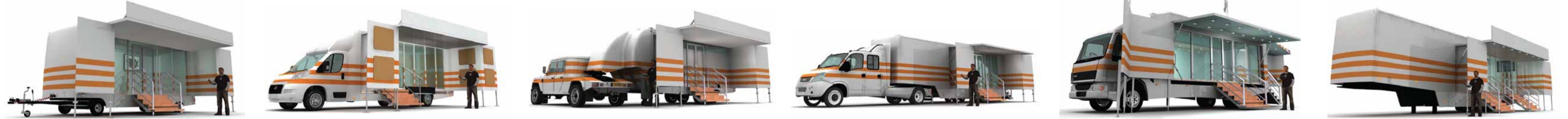
13.86 M. SQ. INTERNAL FLOOR AREA, MARKETING SUITE / 3.5T - 7M TURNABLE STEER | 12.76 M. SQ. INTERNAL FLOOR AREA, MARKETING SUITE / 5.0T - 8.1M TRI-AXLE LOW FLOOR VAN | 13.2 M. SQ. INTERNAL FLOOR AREA, MARKETING SUITE / 7.0T - 8M OFF ROAD LIGHTWEIGHT ARTIC | 28.8 M. SQ. INTERNAL FLOOR AREA, MARKETING SUITE / 8.25T - 9M PODED CANOPY LIGHTWEIGHT ARTIC | 30 M. SQ. INTERNAL FLOOR AREA, MARKETING SUITE / 12T - 8M PODED CANOPY RIGID TRUCK | 46.8 M. SQ. INTERNAL FLOOR AREA, MARKETING SUITE / 28T - 13.9M PODED CANOPY SEMI-TRAILER