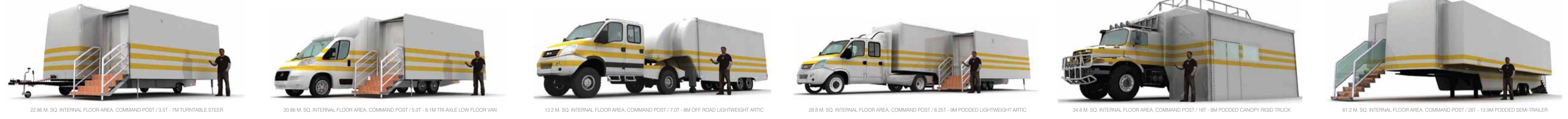
22.86 M. SQ. INTERNAL FLOOR AREA, COMMAND POST / 3.5T - 7M TURNABLE STEER | 20.86 M. SQ. INTERNAL FLOOR AREA, COMMAND POST / 5.0T - 8.1M TRI-AXLE LOW FLOOR VAN | 13.2 M. SQ. INTERNAL FLOOR AREA, COMMAND POST / 7.0T - 8M OFF ROAD LIGHTWEIGHT ARTIC | 28.8 M. SQ. INTERNAL FLOOR AREA, COMMAND POST / 8.25T - 9M PODED LIGHTWEIGHT ARTIC | 34.8 M. SQ. INTERNAL FLOOR AREA, COMMAND POST / 12T - 8M PODED CANOPY RIGID TRUCK | 61.2 M. SQ. INTERNAL FLOOR AREA, COMMAND POST / 28T - 13.9M PODED SEMI-TRAILER