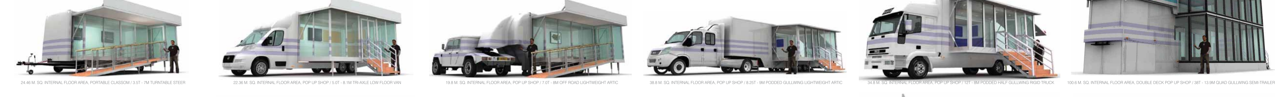
24.46 M. SQ. INTERNAL FLOOR AREA, PORTABLE CLASSROOM / 3.5T - 7M TURNABLE STEER | 22.36 M. SQ. INTERNAL FLOOR AREA, POP UP SHOP / 5.0T - 8.1M TRI-AXLE LOW FLOOR VAN | 19.8 M. SQ. INTERNAL FLOOR AREA, POP UP SHOP / 7.0T - 8M OFF ROAD LIGHTWEIGHT ARTIC | 38.8 M. SQ. INTERNAL FLOOR AREA, POP UP SHOP / 8.25T - 9M PODED GULLWING LIGHTWEIGHT ARTIC | 34.8 M. SQ. INTERNAL FLOOR AREA, POP UP SHOP / 12T - 8M PODED HALF GULLWING RIGID TRUCK | 100.6 M. SQ. INTERNAL FLOOR AREA, DOUBLE DECK POP UP SHOP / 28T - 13.9M QUAD GULLWING SEMI-TRAILER