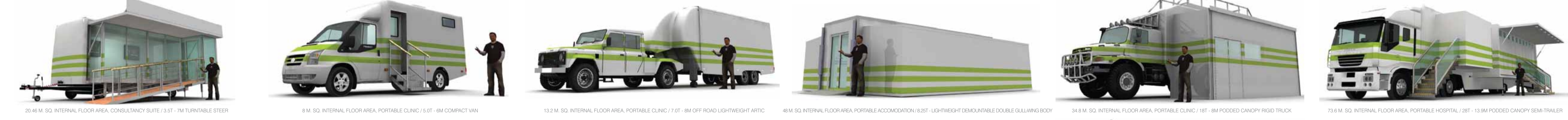
20.46 M. SQ. INTERNAL FLOOR AREA, CONSULTANCY SUITE / 3.5T - 7M TURNABLE STEER | 8 M. SQ. INTERNAL FLOOR AREA, PORTABLE CLINIC / 5.0T - 8M COMPACT VAN | 13.2 M. SQ. INTERNAL FLOOR AREA, PORTABLE CLINIC / 7.0T - 8M OFF ROAD LIGHTWEIGHT ARTIC | 48 M. SQ. INTERNAL FLOOR AREA, PORTABLE ACCOMMODATION / 8.25T - LIGHTWEIGHT DEMOUNTABLE DOUBLE GULLWING BODY | 34.8 M. SQ. INTERNAL FLOOR AREA, PORTABLE CLINIC / 12T - 8M PODED CANOPY RIGID TRUCK | 73.6 M. SQ. INTERNAL FLOOR AREA, PORTABLE HOSPITAL / 28T - 13.9M PODED CANOPY SEMI-TRAILER