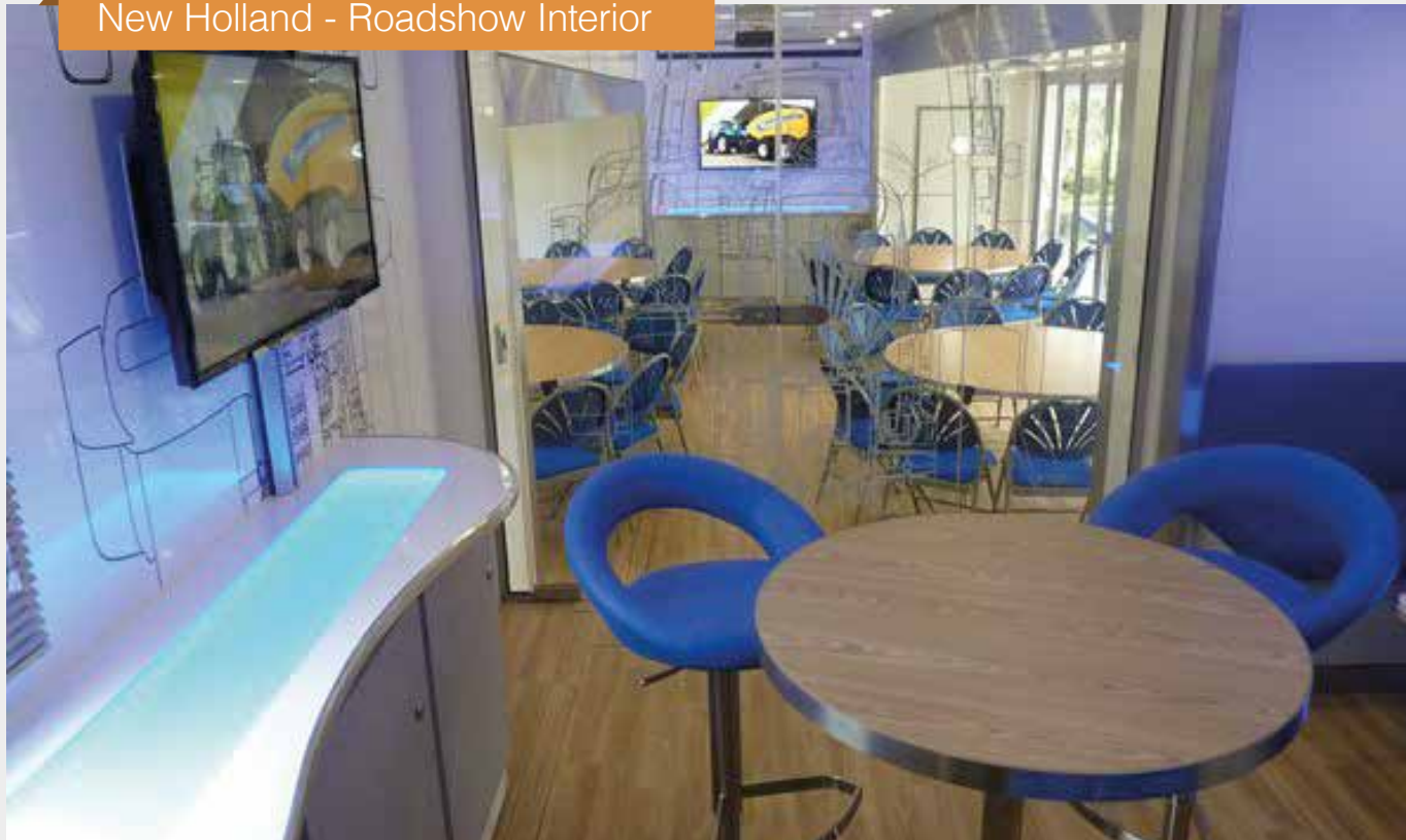
New Holland - Roadshow Interior